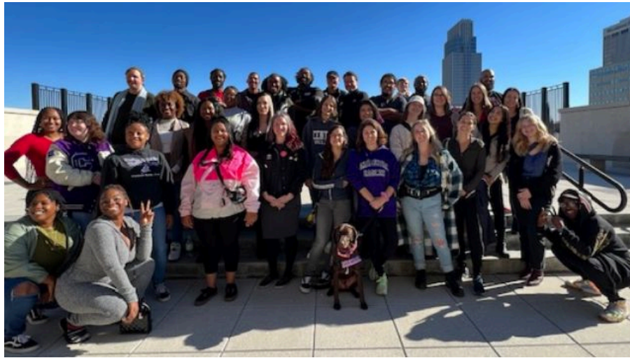
The Class of 2012 at their class reunion in 2022!