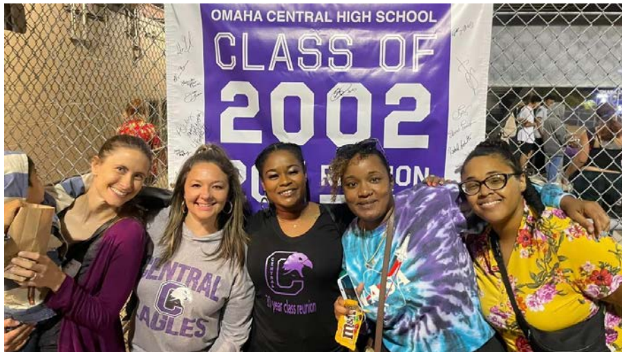
The Class of '02 at their class reunion in 2022!