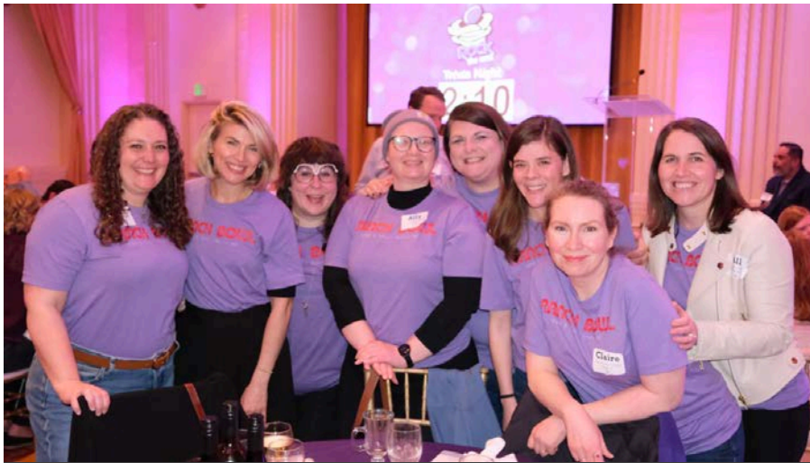
PICTURED: Team "C U at the Ranch Bowl" placed 4th

More than 250 alumni, students, teachers, and parents rocked the nest at the 14th annual Rock the Nest Trivia Night earlier this month. On a new night and at a new venue, Rock the Nest raised over $35,000 for Central High School. For the first time ever, a student team won the competition! Congratulations to our trivia team winners: