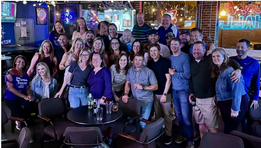
The Class of 1992 at their class reunion in 2022!