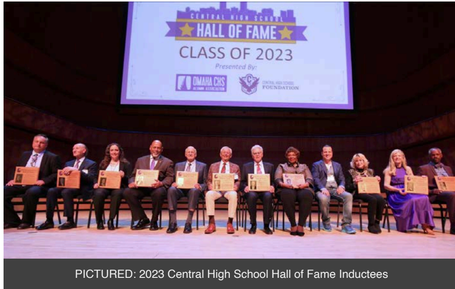
PICTURED: 2023 Central High School Hall of Fame Inductees

It is our pleasure to announce the incoming Class of 2024 of the Central High School Hall of Fame! These inductees have exemplified the Eagle spirit of excellence in their respective communities, in their professional endeavors, and in their ceaseless efforts to give back to others. The 2024 Hall of Fame ceremony will be held on Thursday, October 17, 2024, at Central High School.